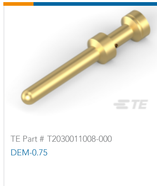
TE Part # T2030011008-000 DEM-0.75