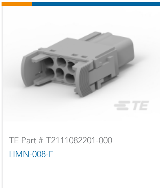
TE Part # T2111082201-000 HMN-008-F